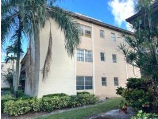
Building right side view.