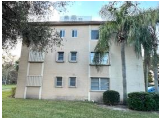
Building left side view.