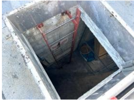
Reinforced concrete roof deck.