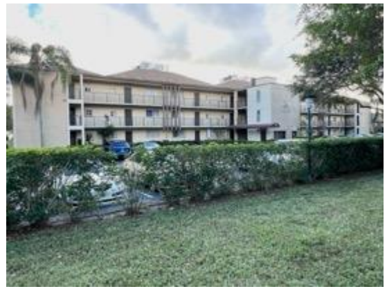
Building front view.