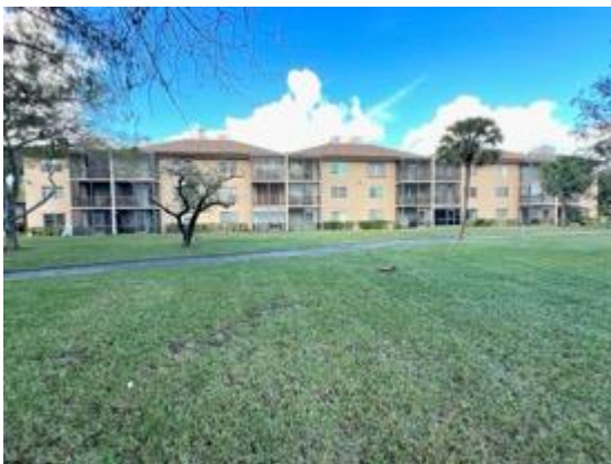
Building rear view.