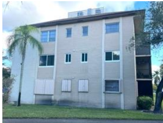
Building left side view.