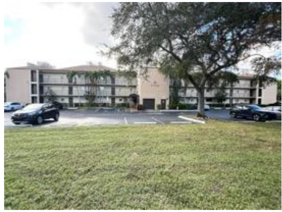
Building front view.