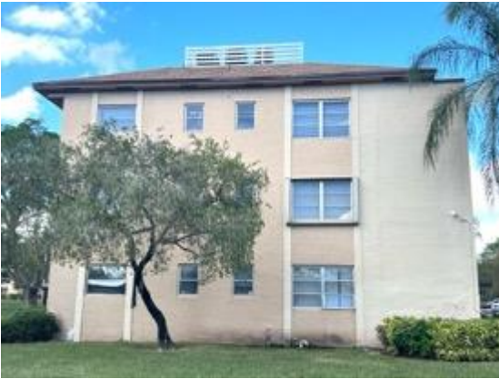
Building right side view.