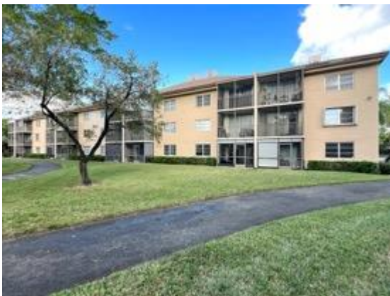
Building rear view.