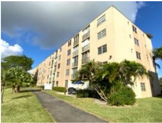
Building rear view.