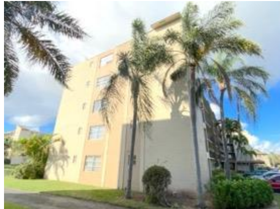
Building left side view.