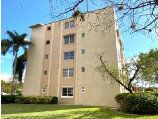
Building right side view.