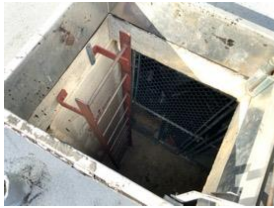
Reinforced concrete roof deck.