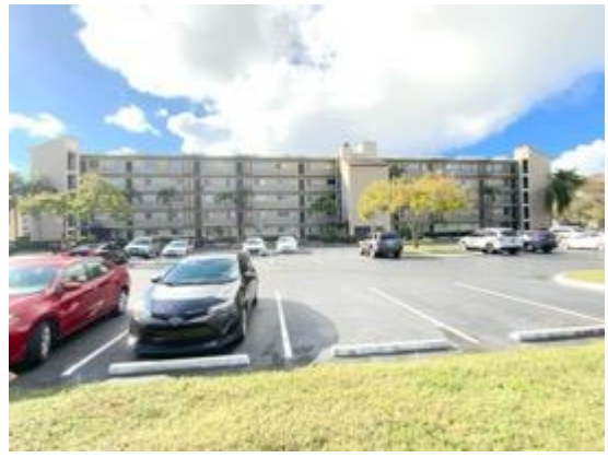
Building front view.