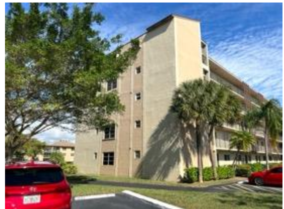
Building left side view.