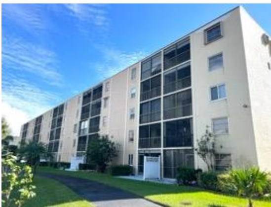
Building rear view.