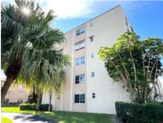
Building right side view.