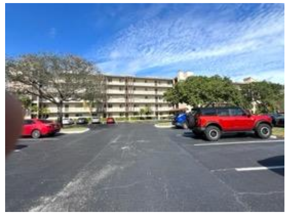
Building front view.