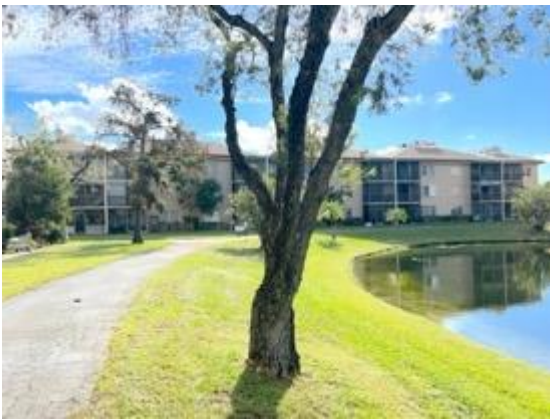
Building rear view.