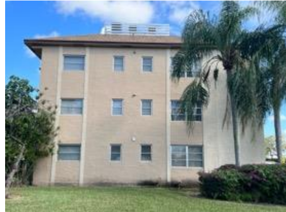
Building left side view.