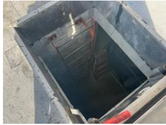
Reinforced concrete roof deck.