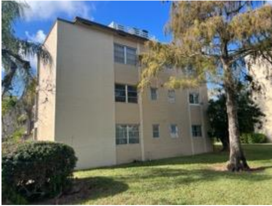
Building right side view.