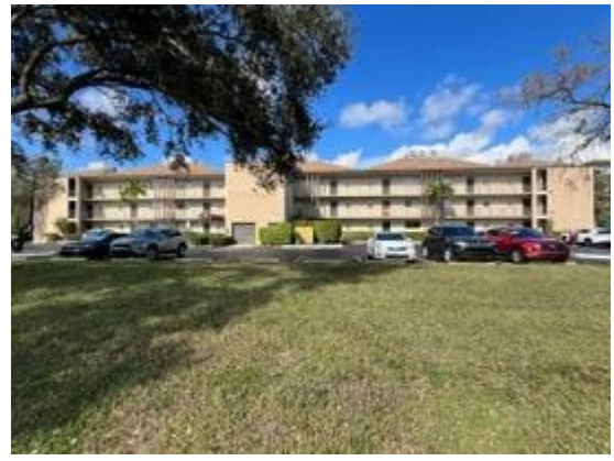
Building front view.