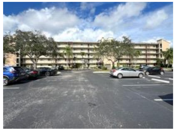
Building front view.