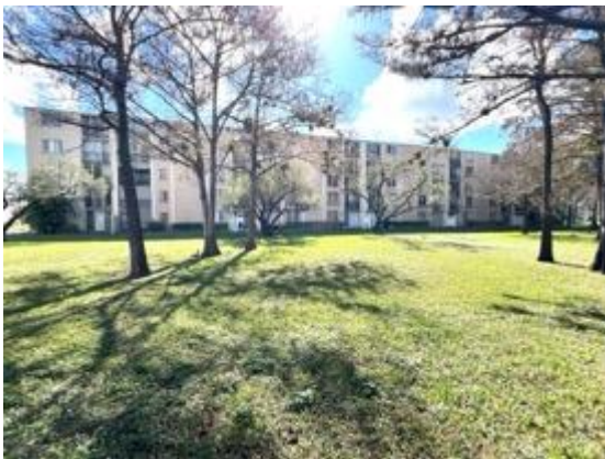
Building rear view.