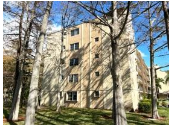
Building left side view.