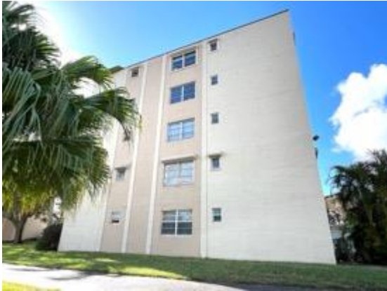
Building right side view.