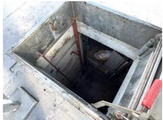
Reinforced concrete roof deck.