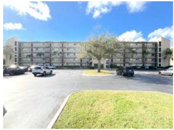
Building front view.