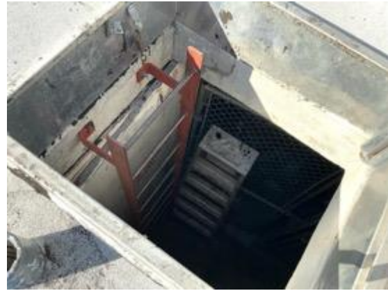
Reinforced concrete roof deck.