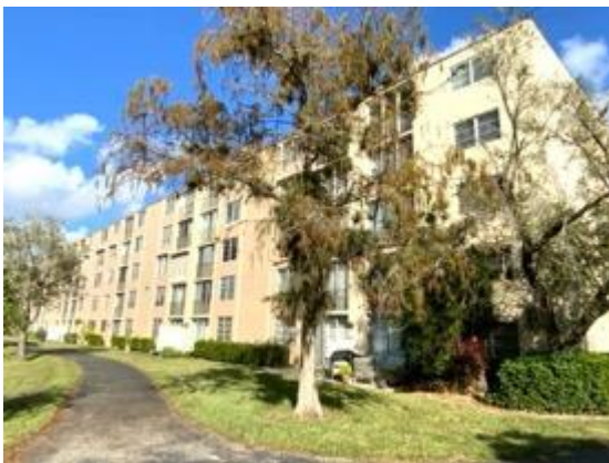
Building rear view.