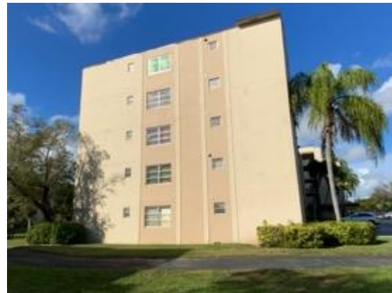
Building left side view.