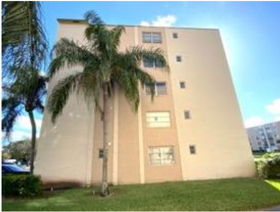
Building right side view.