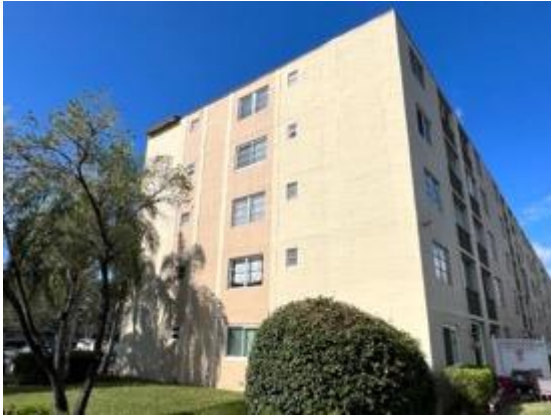
Building right side view.