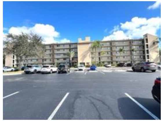
Building front view.