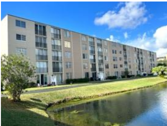
Building rear view.