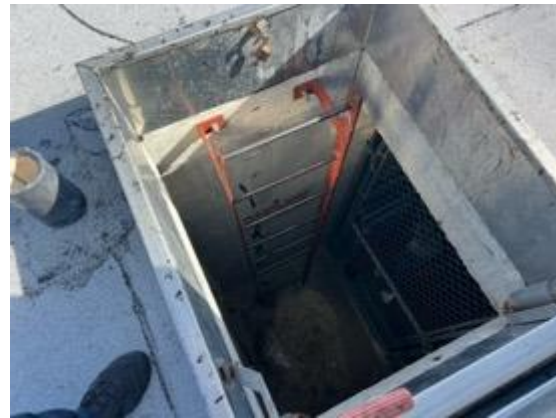
Reinforced concrete roof deck.