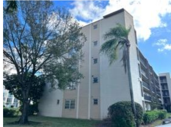
Building left side view.